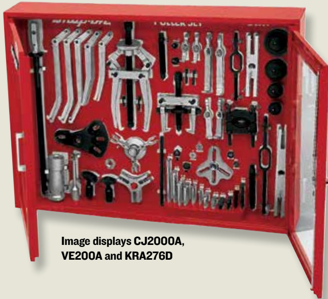
Image displays CJ2000A, VE200A and KRA276D